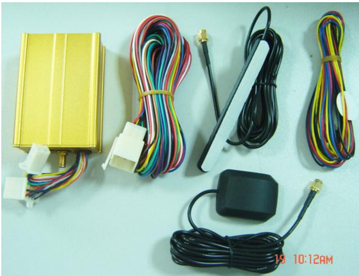
Figure 1. EDW-310BB appearance

EDW-310BB which come in a compact design is a powerful real time fleet management and vehicle tracking system using high sensitivity GPS and wireless GSM/GPRS communication. This self-contained and autonomous tracking device including GSM module, GPS receiver, Li-ion battery and Multi analog input is able to be used as observing the location of vehicle ,detecting temperature ,detecting fuel costing.