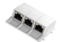
ETHERNET MODULE KT-6511-0000D-WR

For more information on how the AP 6511 can benefit your business, please visit us on the web at www.motorola.com/ap6511 or access our global contact directory at www.motorola.com/enterprisemobility/contactus